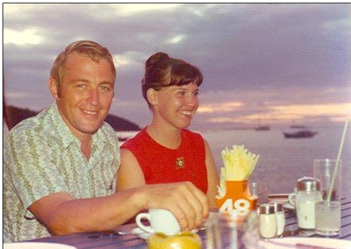
Pattaya Beach, Thailand: Celebrating 5th Wedding Anniversary