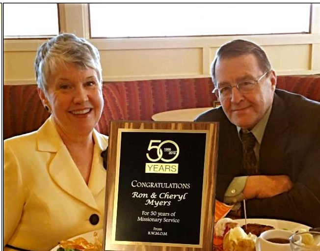
Celebrating 50 Years Anniversary of Ministry Service